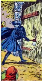
T he Black Knight splintered the postern with his axe.