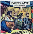
THE DISMOUNTED KNIGHT IS TRULY A MATCH FOR BOIS-GUILBERT.