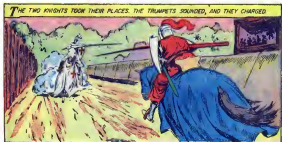
THE TWO KNIGHTS TOOK THEIR PLACES. THE TRUMPETS SOUNDED, AND THEY CHARGED